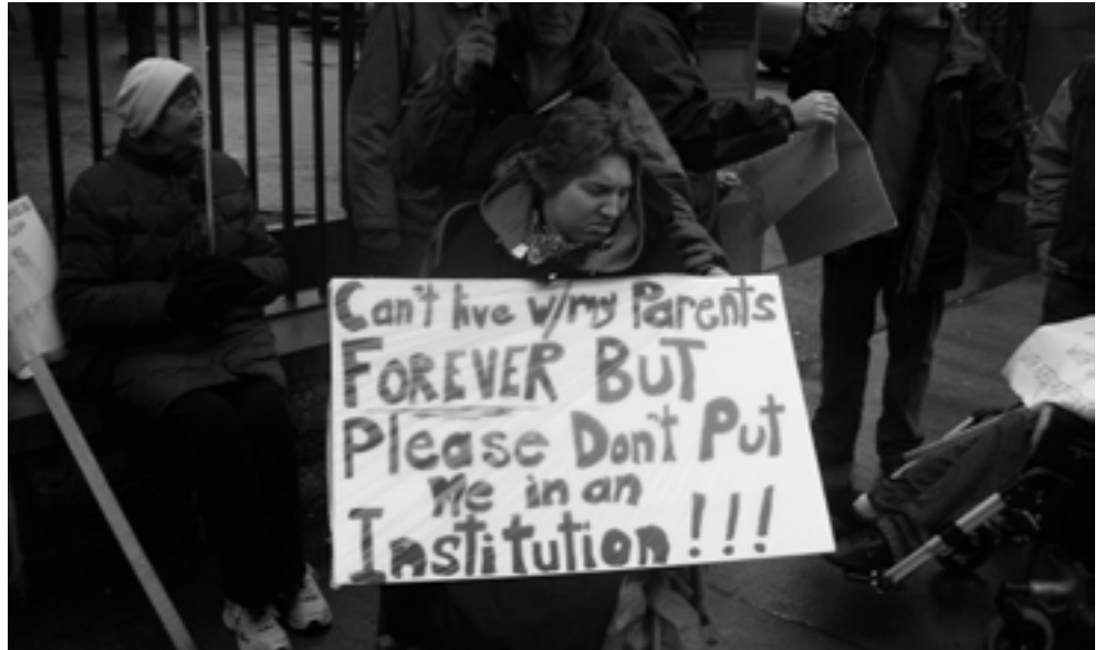
December 2012 rally at Province House. A Community Services initiative to address complaints is not moving as fast as was initially suggested.