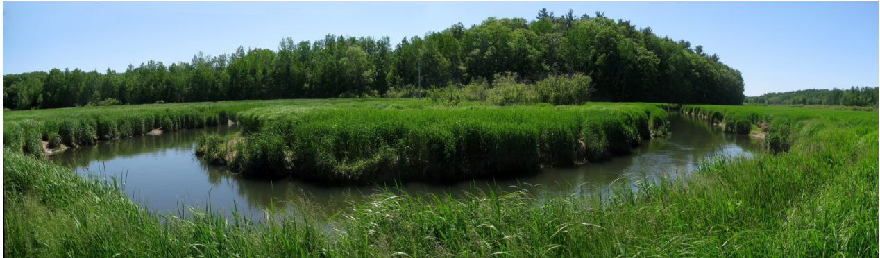
The Jijuktu'kwejk River near Kentville (behind Meadowview Community Hall)

The river that runs through the eastern Annapolis Valley, carrying the fresh waters of runoff & spring water to the sea, have pulsed with the rhythms of the tides since before human beings were known to have roamed this part of the earth. For millennia these waters have nourished creatures along their banks & nestled in the iron-rich silt & salt marsh grasses of the wetlands & inter-tidal areas they flood over.